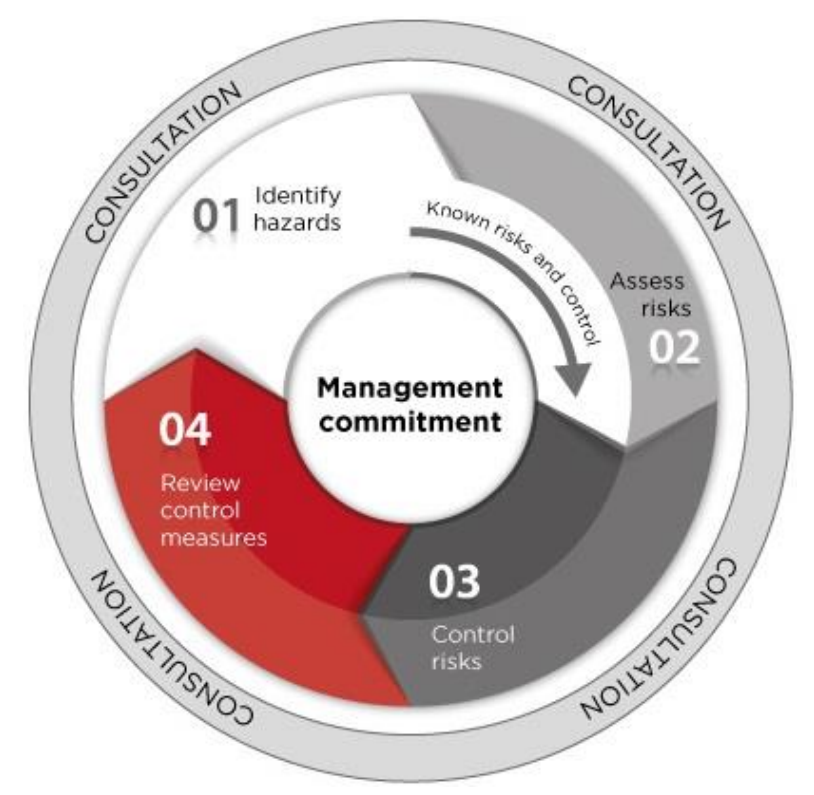
Figure 1 The risk management process

Further information is available in the Interpretive Guideline: <u>The meaning of 'reasonably</u> <u>practicable'</u>. The process of managing risk described in this Code will help you decide what is reasonably practicable in particular situations so that you can meet your duty of care under the WHS laws.