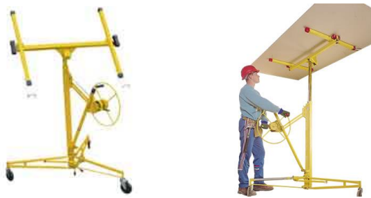
Caption: Manual sheet lifter

Where it is not reasonably practicable to use a sheet lifter and the sheet is to be manually fixed to the ceiling, use three workers for a team lift.